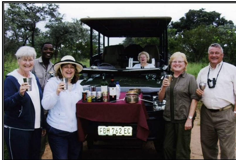
Tour members enjoy a sundowner in South Africa's Kruger National Park in March, 2009.

Leave your worries behind, and get going! →