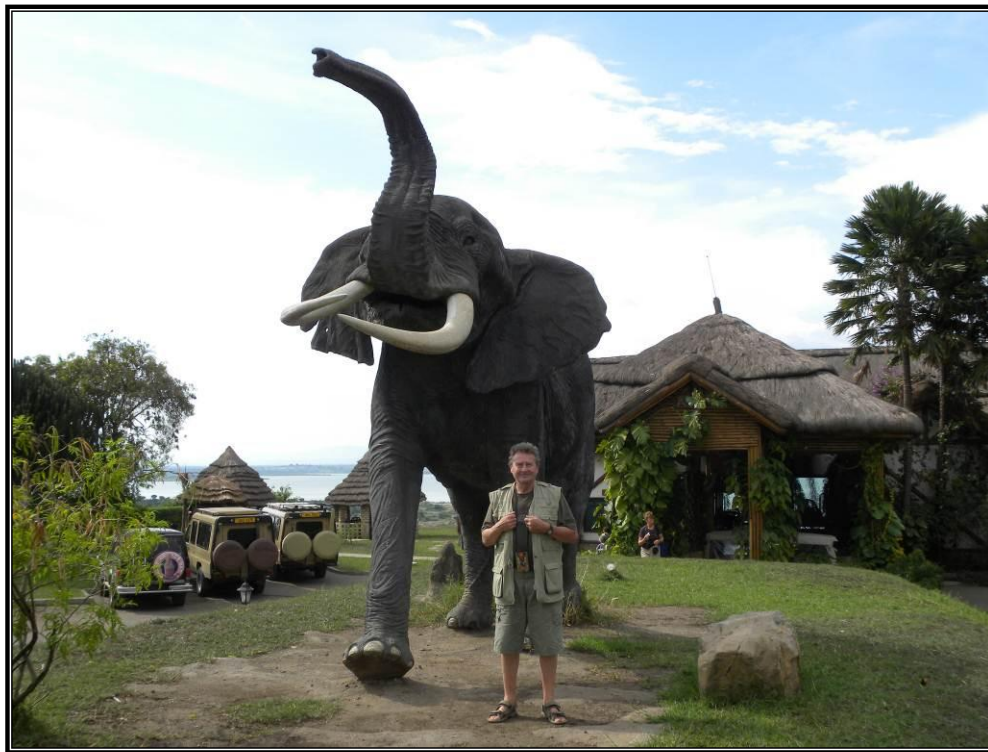
With love from the beautiful Mweya Safari Lodge in Uganda . . .

Enjoy yourself. It's later than you think! →