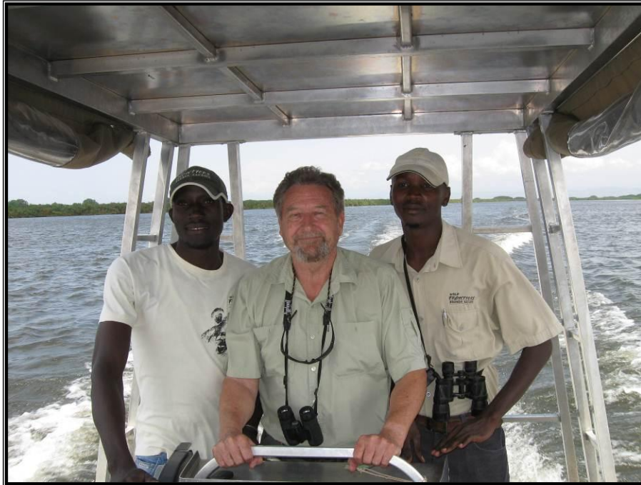
From Africa with love . . .

Enjoy your life. It's the only one you have! ➔