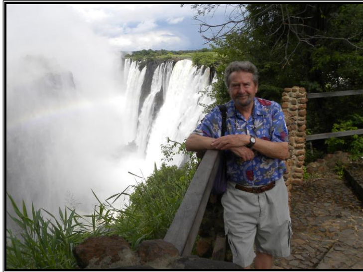
From the spray of Victoria Falls in Zambia, with love . . .

My mission is to encourage, motivate, and inspire you to get the most out of life. Get up and go! I invite you to join me on one of my life-enriching tours. ➔